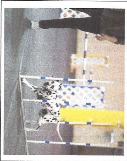
DCA Top Spot